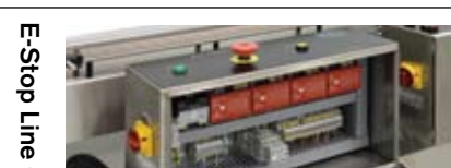
E-Stop Line Control Mushroom buttons providing quick access.