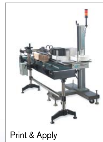
Print & Apply

Additional Line Options: Print & Apply Retorquer Liquid Filler