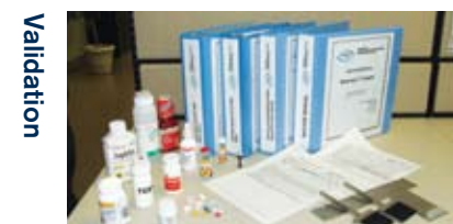
Validation NJM provides validation & documentation for pharmaceutical regulatory requirements.