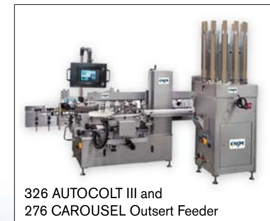
326 AUTOCOLT III and 276 CAROUSEL Outsert Feeder